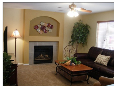
Highlands Ranch—March 2011