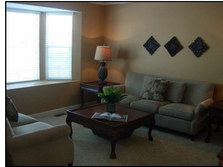
Highlands Ranch — February 2011